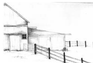
Sharon Hollow Farm